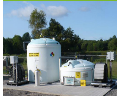
Hydrogen peroxide with catalyst

For customers interested in using less hazardous materials, US Peroxide can provide Hydrogen Peroxide as a Class 1 Oxidizer (27%) or as a non-rated chemical (<8%). Other concentrations are available upon request.