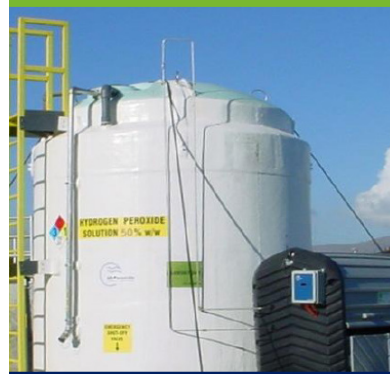
USP-5000 with seismic option